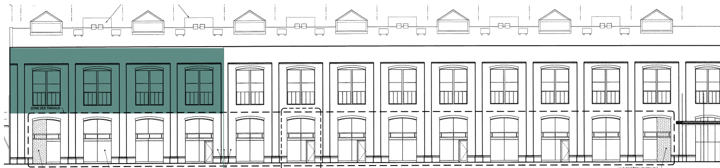
Space located on the rear facade